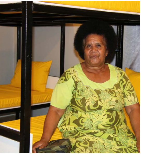
WOMEN'S ACCOMMODATION CENTRE'S OFFER A SAFE PLACE FOR RURAL WOMEN MARKET VENDORS IN THE PACIFIC